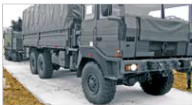
Ground Improvement Mat